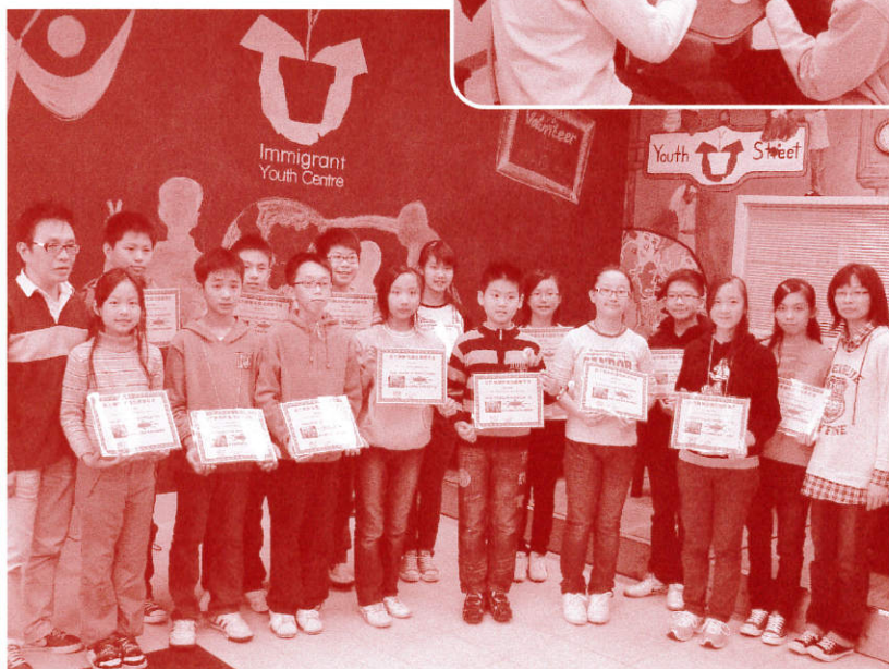
Youth at IYC