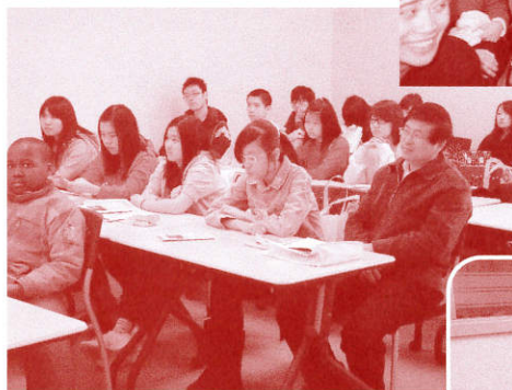
Road to success seminar