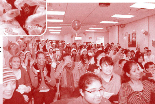
Year end party at MSWC