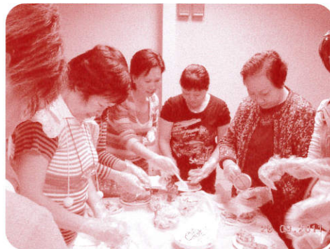
Moms and grannies nutrition class