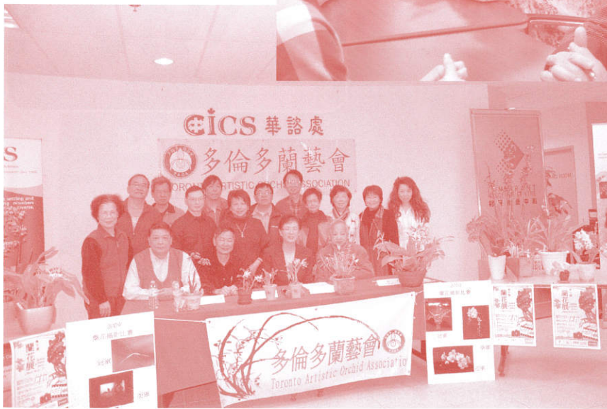
Orchid show press conference

"As a housewife, this program reconnects me with the outside world and takes me to a new horizon."